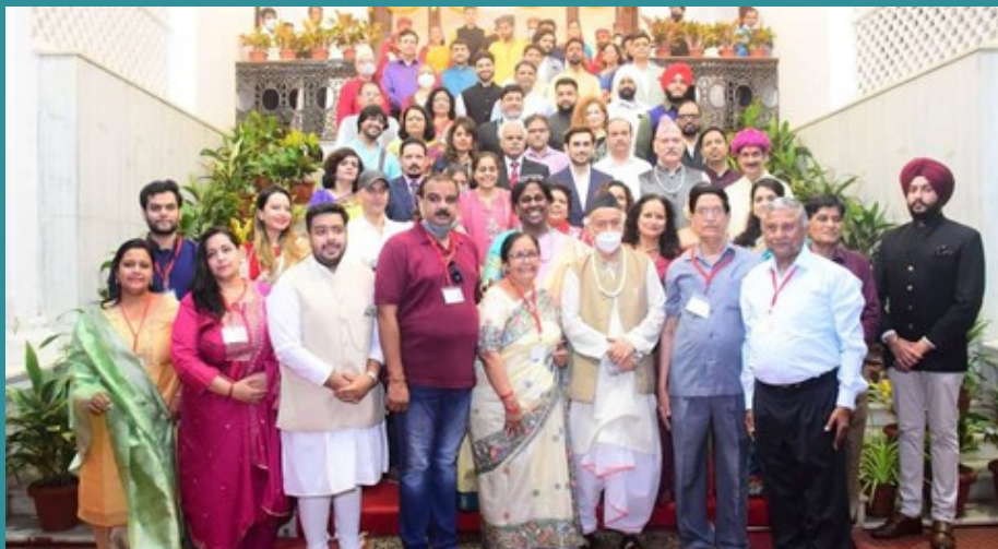
Ondede staff meeting in Bombay with his Excellency the Governor of Maharashtra and the Minister of Education.

The Covid-19 pandemic brought new challenges to vulnerable populations in India, including sex workers, trans people and trans youth. Ondede used SOAR funding to hold a free vaccination campaign for members of vulnerable groups alongside educational initiatives to teach the importance of vaccination against Covid-19. Ondede provided vulnerable communities access to psychosocial services in coordination with a variety of hospitals and healthcare officials, raising awareness about the importance of mental health and gender-inclusive curriculum under mental health policy. The organization met with public and private hospitals to discuss the importance of gender-affirming surgery and facilitated the launch of a committee across multiple hospitals to create guidelines for medical care for trans people. Ondede engaged in advocacy work for the implementation of a 2021 order of the Karnataka High Court for welfare measures supporting trans people. Ondede researched the impact of Covid-19 on vulnerable communities and met with government officials to discuss community struggles and the inclusion of sexual minorities under its state education policy. The organization also organized a civil society gathering to discuss the challenges of vulnerable communities during the pandemic.