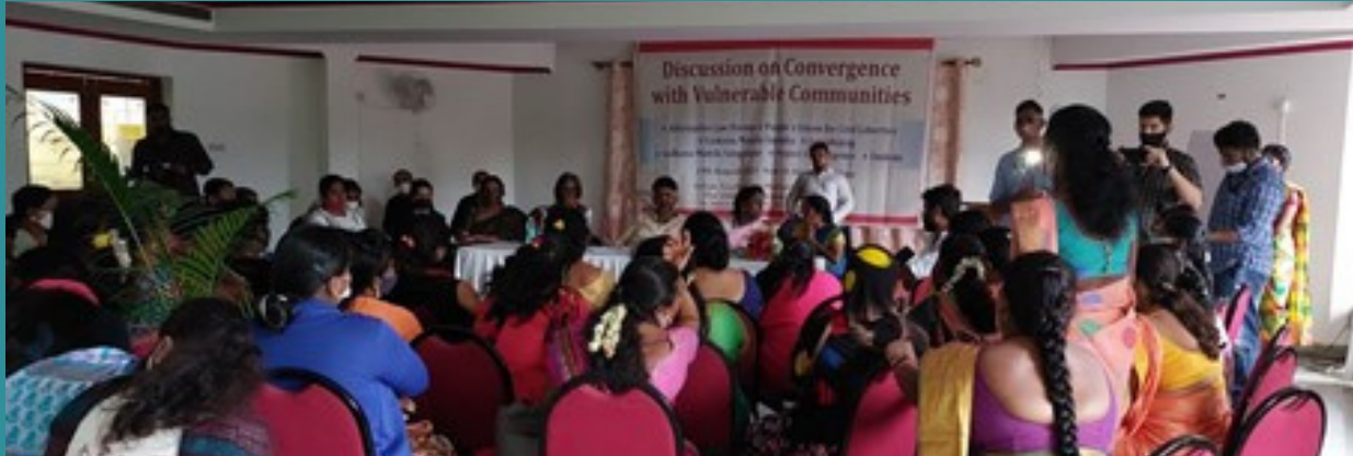
Ondede distributes information on the importance of vaccination among vulnerable communities.

The Covid-19 pandemic brought new challenges to vulnerable populations in India, including sex workers, trans people and trans youth. Ondede used SOAR funding to hold a free vaccination campaign for members of vulnerable groups alongside educational initiatives to teach the importance of vaccination against Covid-19. Ondede provided vulnerable communities access to psychosocial services in coordination with a variety of hospitals and healthcare officials, raising awareness about the importance of mental health and gender-inclusive curriculum under mental health policy. The organization met with public and private hospitals to discuss the importance of gender-affirming surgery and facilitated the launch of a committee across multiple hospitals to create guidelines for medical care for trans people. Ondede engaged in advocacy work for the implementation of a 2021 order of the Karnataka High Court for welfare measures supporting trans people. Ondede researched the impact of Covid-19 on vulnerable communities and met with government officials to discuss community struggles and the inclusion of sexual minorities under its state education policy. The organization also organized a civil society gathering to discuss the challenges of vulnerable communities during the pandemic.